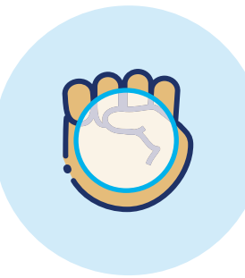
Fruits/Grains & Starches Choose an amount the size of your fist for grains or starches, or fruit.

Your hands can be very useful in estimating appropriate portions. When planning a meal, use the following portion sizes as a guide: