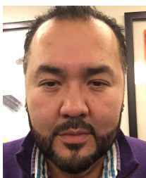
Indigenous Science and Content Co-Chair