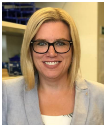
Scientific Section Co-Chair