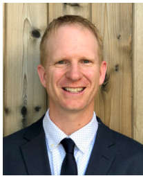
Allied Health Section Co-Chair