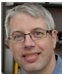
CSEM Section Co-Chair