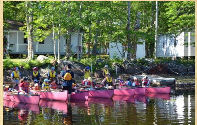
(Campers sitting in red canoes at canoe launch at Camp Lion Maxwell)

Campers will travel as a cabin to seven core activities throughout the day. Each activity is carefully planned and executed to the learning needs and styles of each age group. Campers then get to choose an elective activity in the afternoon that is unique and appealing to them individually.