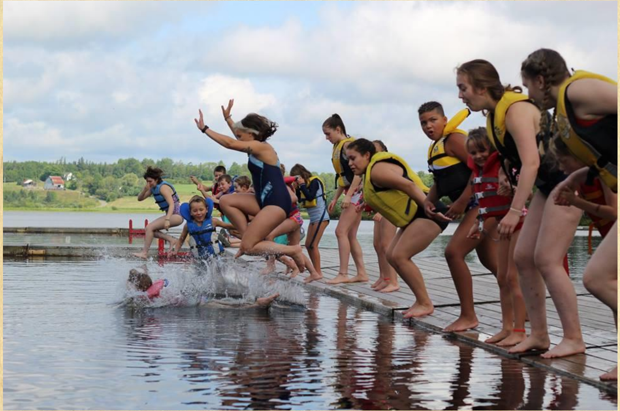
(Campers jumping into lake at Camp Lion Maxwell)